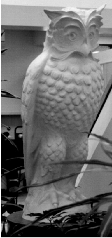
Owl - St. Catharines Public Library logo, statue from original Carnegie Library. Housed at Central Library.